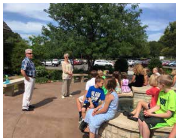
Getting a green thumb with our Garden Angels